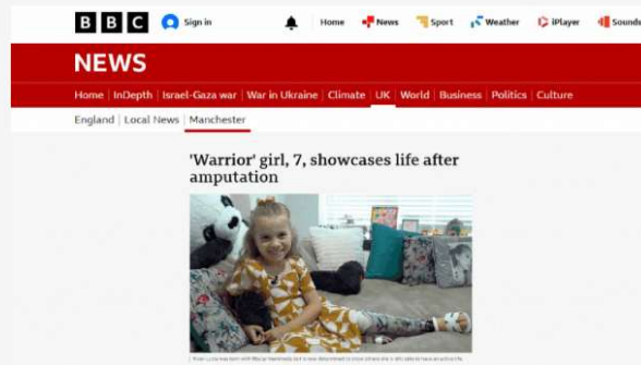
Glowing BBC documentary showcases our Specialised Ability Centre July 31, 2025