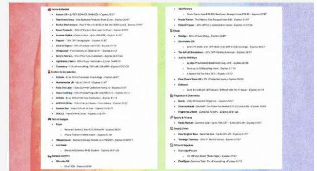
☀ Summer benefits for all staff ☀ July 31, 2025