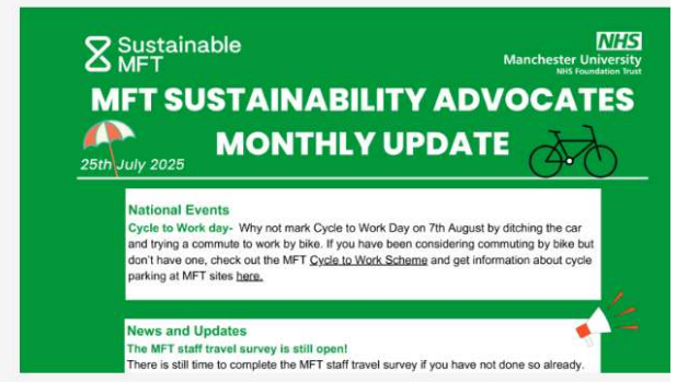
MFT sustainability advocates update – July July 31, 2025