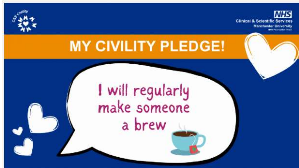
☺ Looking after each other saves lives... It's Civility Month!! ❤️ July 31, 2025

Home Leadership CSS Team Brief Submit a story Civility Freedom to Speak Up Flexible Working